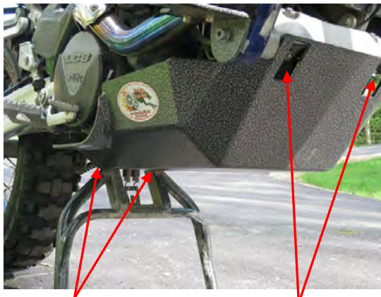
Rear Mounting Bolts