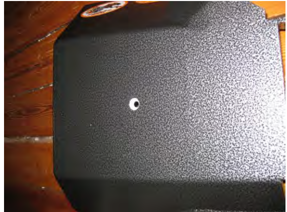
Countersunk hole in bottom of skid plate